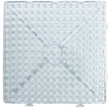
NABBI Jumbo pegboard